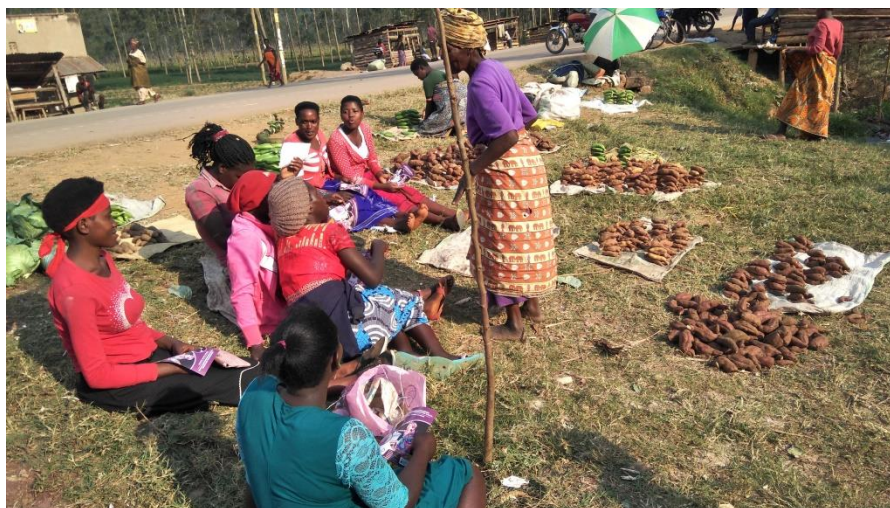
Rural Business women discussing the Flier that enlightens the need to fight the use of Money in Politics (Photo by KICK-U, July 2020)