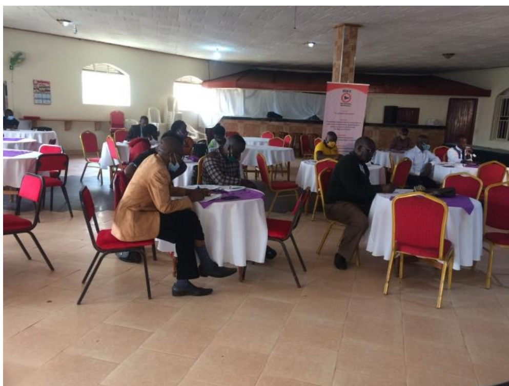
Participants taking notes during the discussion. (Photo by KICK-U, August 2020)