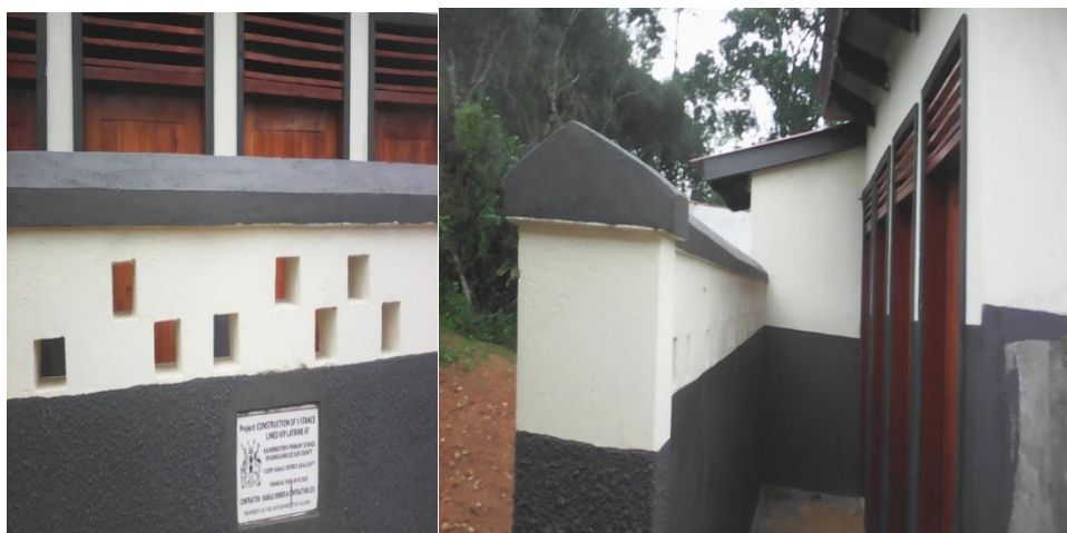
Front and side view of Constructed VIP latrine at Kasheregyenyi P/S Kamuganguzi Subcounty.

Conducted 5 quarterly Joint budget monitoring with duty bearers and communities in the five Sub counties of Kamuganguzi, Kitumba, Buhara, Southern Division and Kaharo. 10 service delivery centres/offices monitored, 02 sectors of Education, and Health Monitored where 87/100 PBCs and 14/15 CBA's participated in the community budget monitoring in the Five sub counties of Kabale.