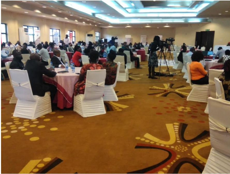
Members of the National Anti-Corruption Teams in attendance at the Convention (Photo by KICK-U, December 2020)