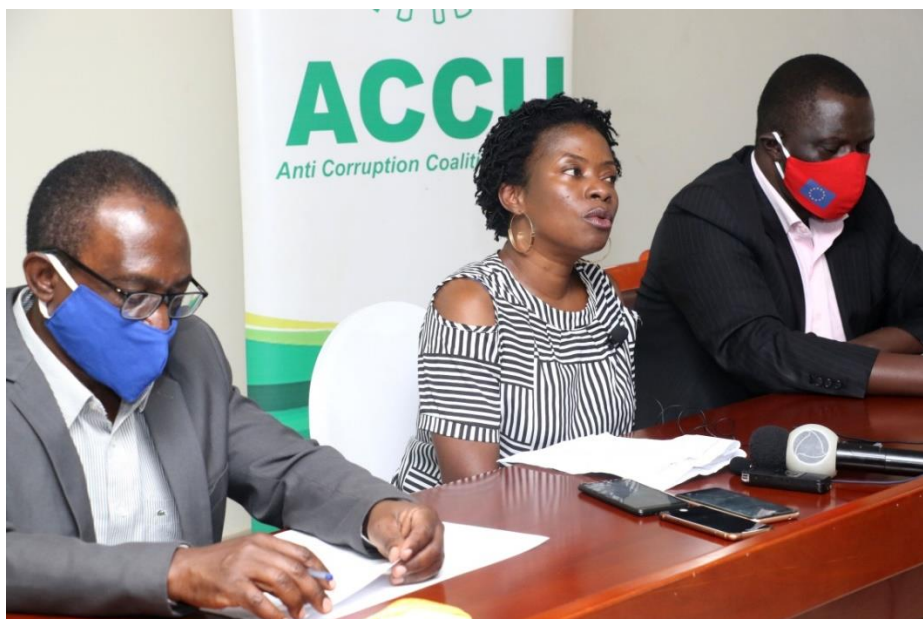
KICK-U and other Anti-Corruption Agencies After Launching The Education Sector Report At Hotel Africana Organised By ACCU and TIU – Kampala