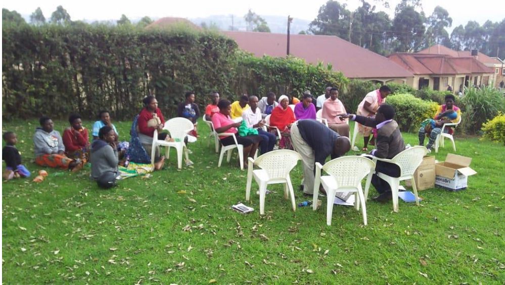
One of the Fire place (Ekyoto) conversations in Kitumba Subcounty – Kabale District (Photo by KICK-U, March 2020)